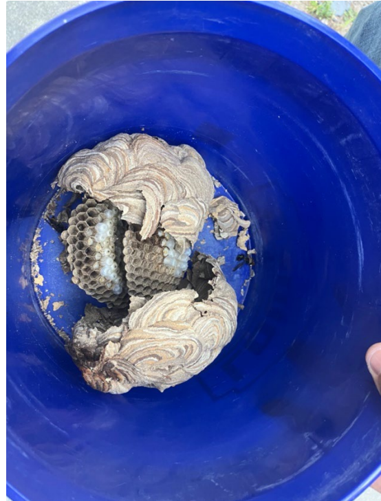
GDA PPD at Georgia Green Industry Association's Southeast Green Conference Staff from the Department's Plant Protection Division attended GGIA's Southeast Green Conference in Duluth, Ga, from June 4-6. Their focus was educating GGIA's membership on the Yellow-Legged Hornet and the Department's ongoing efforts to eradicate it.